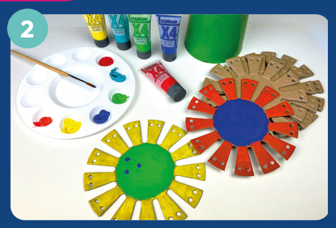
Start by painting your weaving cards using bright colours. Add more than one layer to build up colour. TIP: Remember to paint the back of your cards, as this will be seen too!