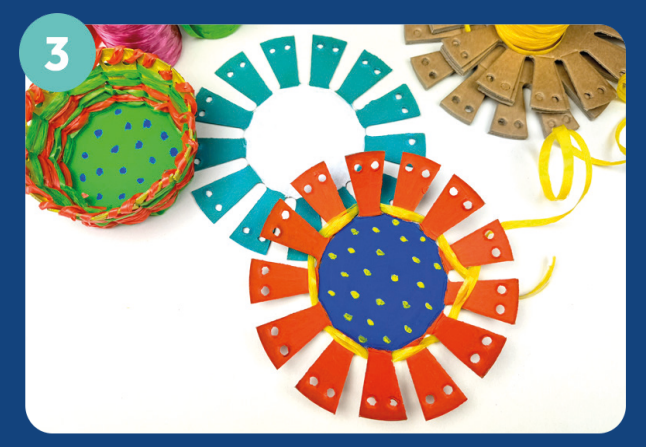
Once the paint is dry, cut a length of yarn (approx. 60cm) and begin to guide the yarn through the weaving card in an under-over pattern in a clockwise direction, leaving a tail of about 10cm on the outside of the basket. Every few rows, use your fingers to push the yarn towards the centre of the card so that it looks nice and uniform.