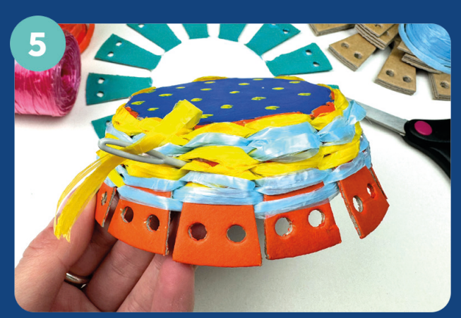
Next, neaten the yarn ends sticking out of your basket. Using a tapestry needle to tuck these away inside the weaving: thread the end of the yarn through the needle, insert the needle through your weaving, in between the weft threads, and pull the needle through with the yarn, pull it tight, and cut off the end.