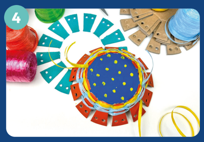
When you come to the end of your yarn, leave a tail of at least 10cm hanging on the outside of the basket, and start weaving with a new length of yarn, following the exact directions as before. Use a selection of colours to add bright stripes to your basket. Continue weaving until you reach the edge of the basket.