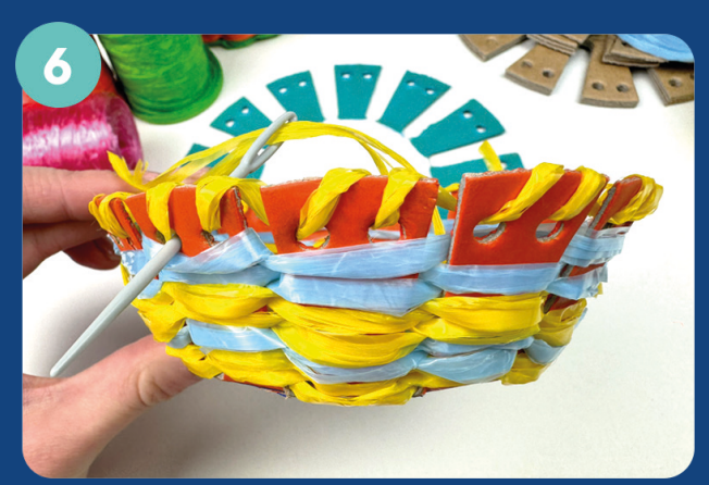
Round weaving cards have a series of punched holes in the top of the card. These holes can be used to stitch along the top of the card to create a neat, decorative edge. Tuck these ends away using the same method as above.