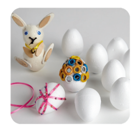
Polystyrene Eggs 40mm Diameter