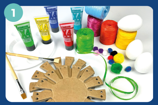
For this project, you will need round weaving cards, raffia reels, X4 Standard Acryl, paint brushes, palette and decorating accessories such as pom poms and polystyrene eggs.