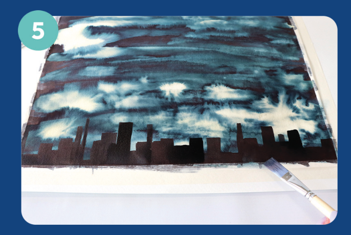
Once this layer is dry, using a flat brush, paint the outline of your skyline along the bottom of the paper using BL-ink.