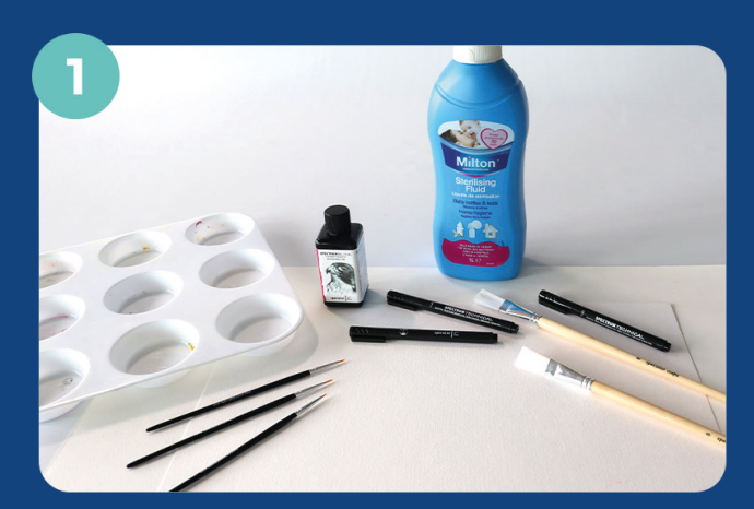
Prepare your workspace. You will need a range of brushes, including small detail brushes, masking tape and either bleach or sterilising fluid, as well as bleachable BL-ink.