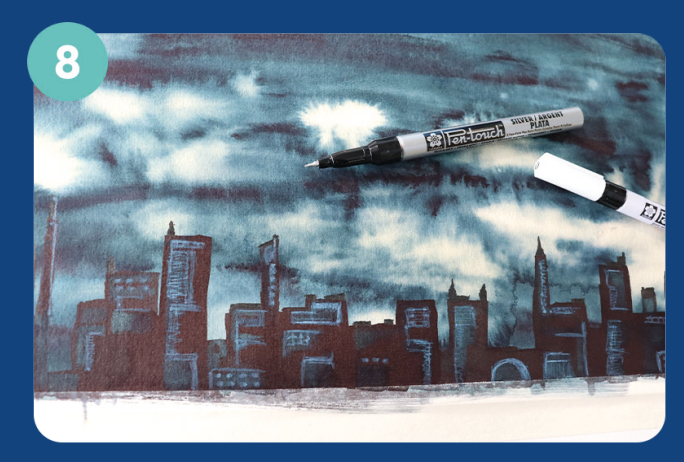
Next, if this isn't enough detail you can use a pen-touch marker in silver or white to add more highlights and details such as windows and reflections. Your pen may not work as well over areas the bleach has been applied to.