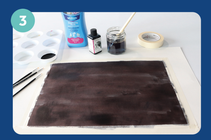
Before letting the water dry, brush on a layer of BL-ink.