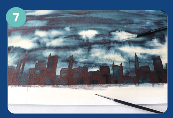
With a thin detail brush, paint on more bleach or sterilising fluid to remove areas of highlight and detailing of your buildings.