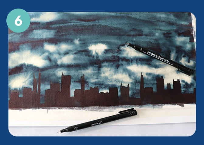
Next, using a fineliner or technical pen, draw on the details of your buildings such as chimneys, spires and rooftops.