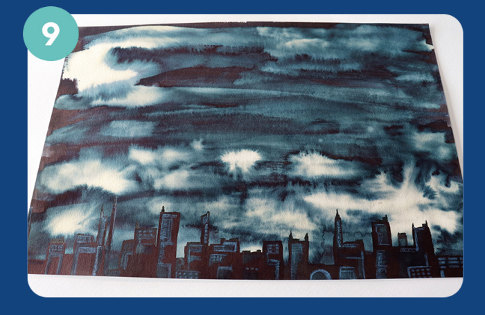
Once your pen and ink is dry your moody skyline is finished!