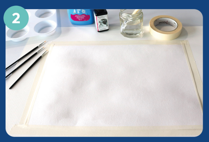
Using masking tape, tape down the edges of your paper if you're not using a sketch pad. Using a thick brush, wet your paper.