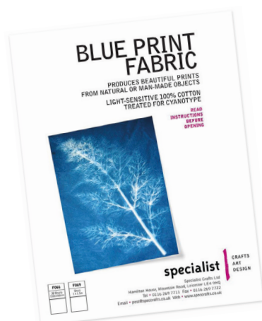
PB080 Specialist Crafts Blue Print Fabric