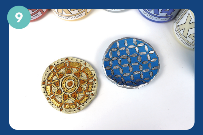
Once the paint is dry and you are happy with your design, apply another layer of PVA glue and water or alternative varnish to protect your coaster or trinket dish.