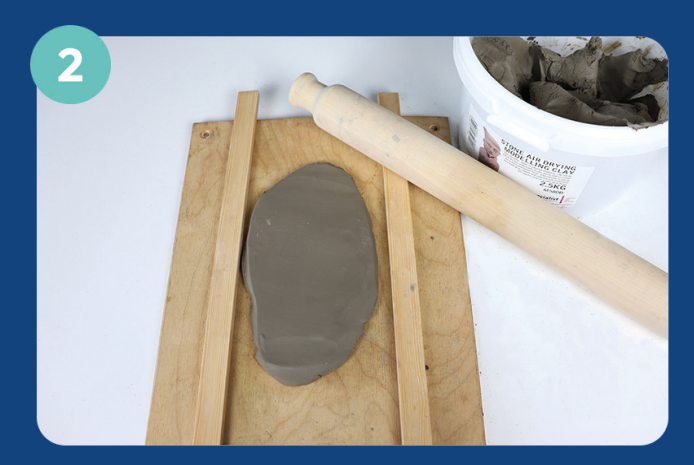
Using rolling guides and a rolling pin, roll out a ball of air drying clay to around 0.5cm thickness.