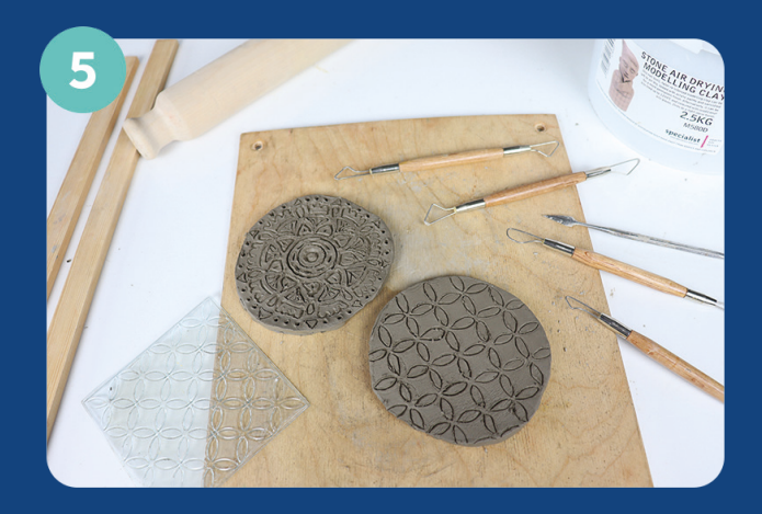
The trick is to create repeated geometric patterns in your design. You can even use templates and stencils to imprint into the clay as a quicker way to create a mandala style design.