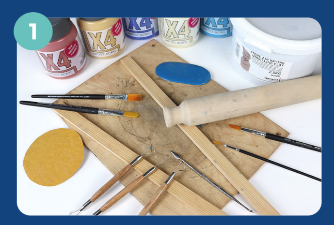
Prepare your workspace, this will get messy! You will need a range of pottery tools such as a rolling pin, cutters and rolling guides, as well as acrylic paints and template materials.