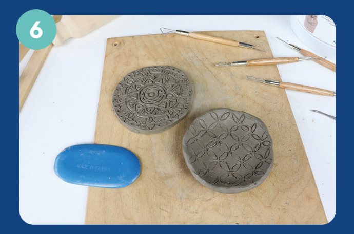
You can keep your clay as a coaster, or you can gently shape up the edges of your circle using a rubber kidney to create a small trinket dish. Be careful not to thin out the edges too much! Then smooth over the edges with the kidney.