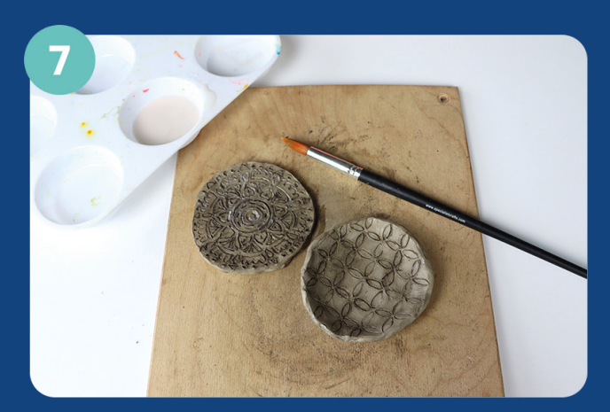
Leave your coaster to air dry for around 12-24 hours. TIP: It should no longer feel cold, if it does, it is not dried out yet! Once dried, apply a layer of PVA glue all over mixed with water to act as a barrier before applying paint.