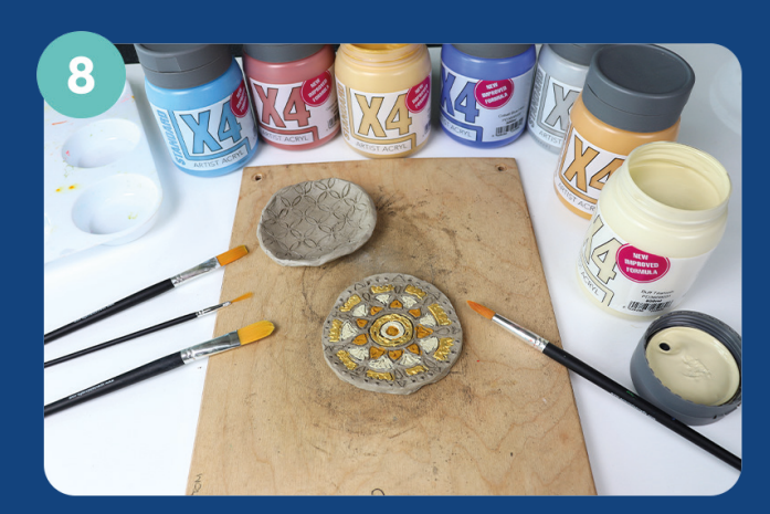
Next, using a range of brush sizes you can begin to paint your design. You may need to apply more than one layer of acrylic paint to build up colour. Why not experiment with metallic colours to really make your coaster stand out!