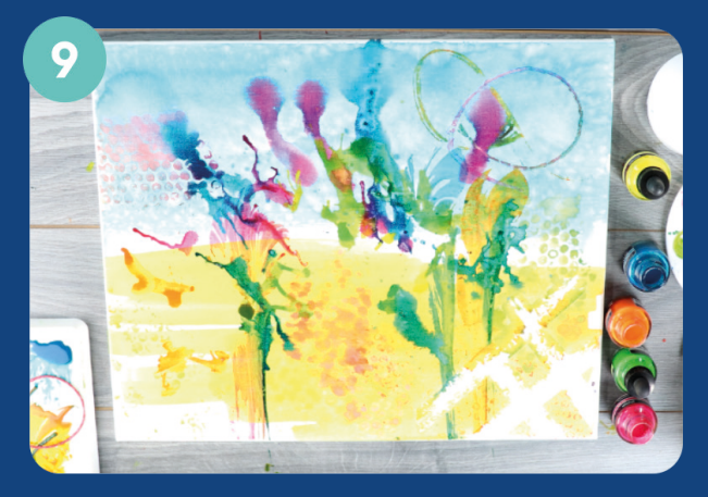
Add finer details using thinner string or cord. Allow your canvas to dry and your artwork is complete!