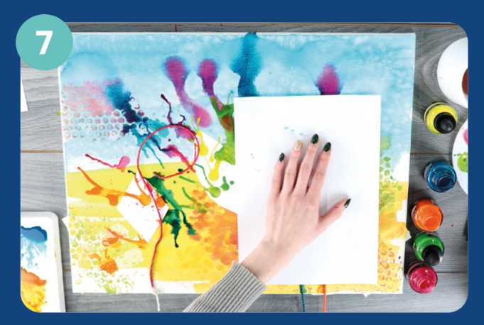
Gently press a piece of paper on top of the string and slowly pull the knot down vertically to reveal a flower/stem shape.