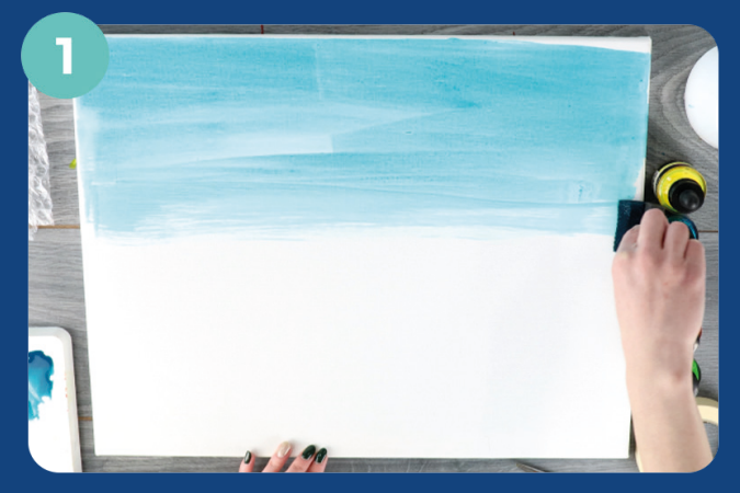
Wet your foam brush and dip it into your ink and apply a wash over parts of your canvas. Spray a small amount of water on top of your wash to leave speckled marks in the ink. You can also mix ink and water in a spray bottle to add more colour to your design.