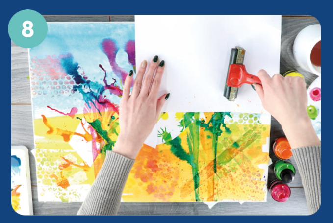
You can add additional effects by rolling over string or zips under a piece of card using an ink roller.