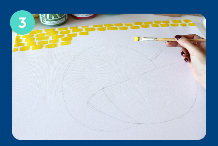
Using a flat brush, start by brushing out dash marks on your background, varying in length using one colour. You can leave gaps of white around the edges of your design.