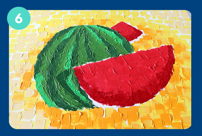
Using a palette knife again, build up your colours using darker and lighter shades of colour. You can make X6 thicker by adding Chromacryl Impasto Gel Medium to give more texture to your design. Caution: This is an extremely strong adhesive, use under supervision.