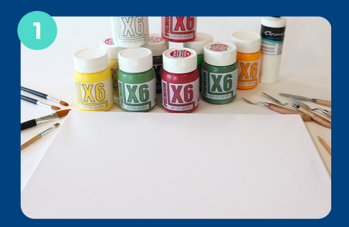
Prepare your workspace, this could get messy! You will need a mixture of brushes and palette knives, as well as shades of X6 Premium Artist Acryl Paints.