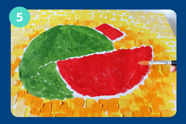
Next, using a round brush, apply a thin layer of paint to your design. This only needs to be rough as we will be building up layers on top. Allow to dry.