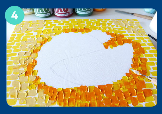
Grab a palette knife and start to build up your background with short landscape strokes. Here you can use a variety of shades to add depth and shadow to your middle ground. Here we used tones of yellow and orange.